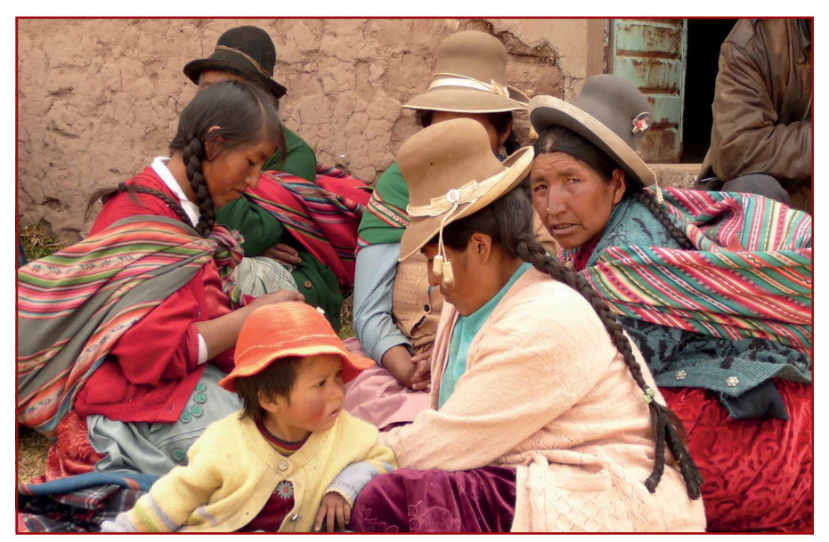
Photo: Ana Beatriz Urbano, 2009 IPC Photo Competition. Women in Lake Arapa, Peru.

beneficiaries also provides an opportunity to introduce relevant topics on health, nutrition, family planning and domestic violence during such training. It is expected that these activities will not only reinforce the programme's effectiveness but also improve the well-being of women beneficiaries by providing adequate tools to empower themselves and lift their households out of poverty.