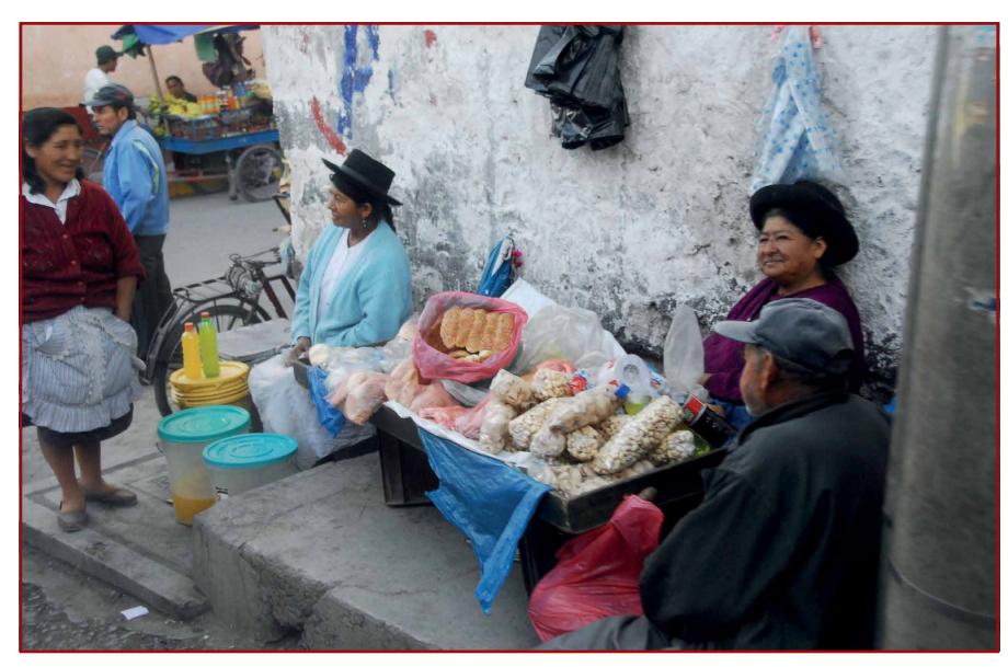
Photo: d.j. a., 2007, Ayacucho, Peru. <a href="https://goo.gl/3lOzLk">https://goo.gl/cefU8>">https://goo.gl/cefU8>">.