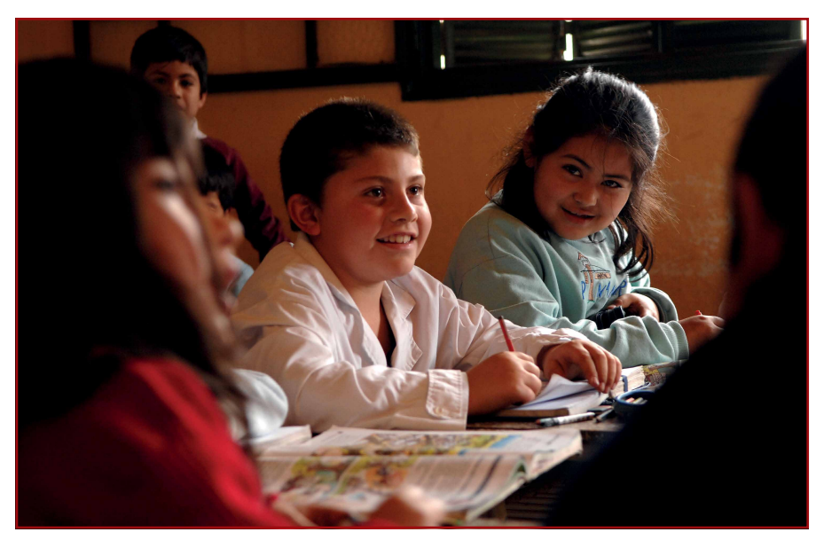
Photo: Nahuel Berger/World bank, Young students in Argentina, 2007 <a href="https://goo.gl/chygNPT">https://goo.gl/cefU8></a>.

Given these results—which we confirm through a conditional econometric analysis—the theoretical reasons to link the programme with labour formality outcomes, and the absence of sensible alternative explanations for divergent