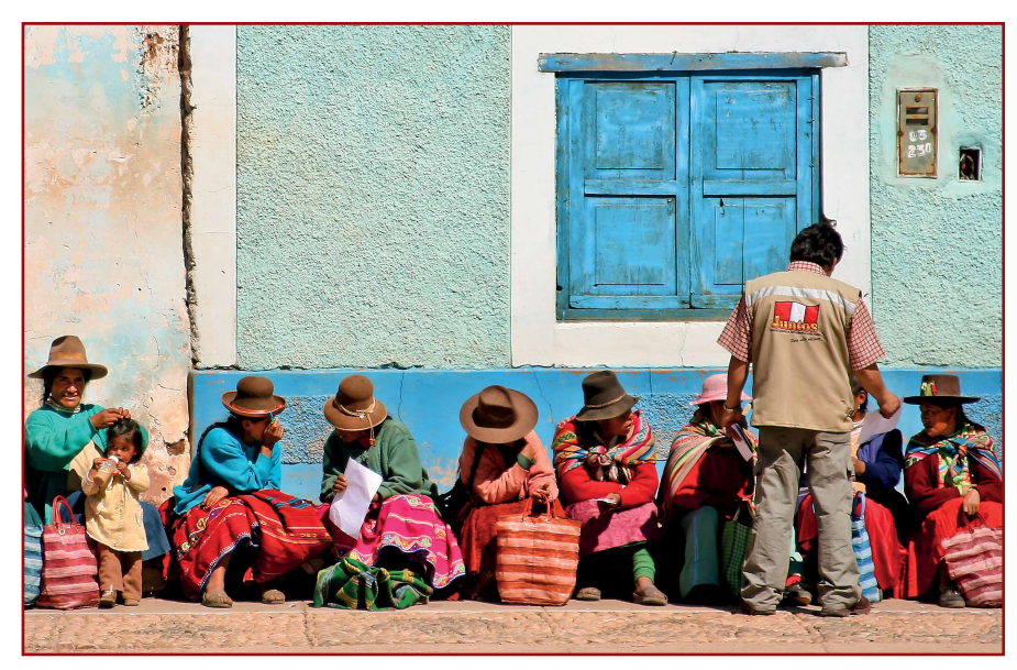
Photo: Douglas Klostermann, 2009 IPC Photo Competition. Indigenous women in Combapata plaza, Peru.

It is important not to lose sight of the main objectives of social grant programmes, namely: smoothing consumption patterns and preventing poor and vulnerable households from adopting harmful strategies to cope with socio-economic shocks. However, the evidence shown throughout the articles of this issue demonstrates that social protection can also have a positive role in labour market activation. The hypothesis of dependency