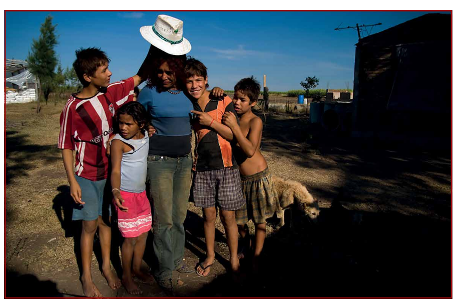
Photo: Montecruz\ Foto, Campo\ Placeres, 2009, Uruguay\ < https://goo.gl/fpRGhA> < https://goo.gl/OOAQfn>.

Money received or earned by women is allocated differently in the household budget compared to money received or earned by men. Women tend to use the money in a way that improves the welfare of the household—and particularly of children—as a whole.