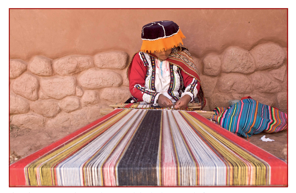
Photo: d.j. a., 2007, Ayacucho, Peru. <a href="https://goo.gl/3IOzLk">https://goo.gl/cefU8>">https://goo.gl/cefU8>">.

increased its formal savings rate from zero to 16 per cent—which is almost double Peru's average formal savings rate (9 per cent). Nonetheless, it is important to note that, after the implementation of the SPP, only 25 per cent of those who wanted to save at a bank had actually done so, suggesting that the financial system may still be physically or culturally removed from the target population.