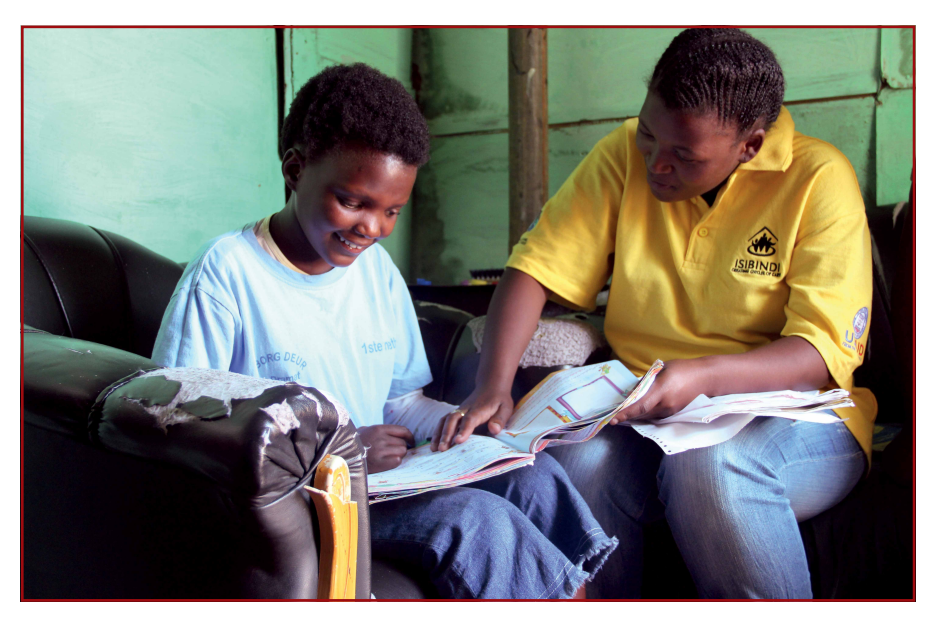
Photo: Linds ay Mgbor/UK \ Department for International Development. \ Working within the community, 2013, South Africa <a href="https://goo.gl/ZisyRq">https://goo.gl/SZ7V7x</a>.

The old-age pension does not appear to have unintended—or adverse—effects on the choices of these rural young men in the labour market.