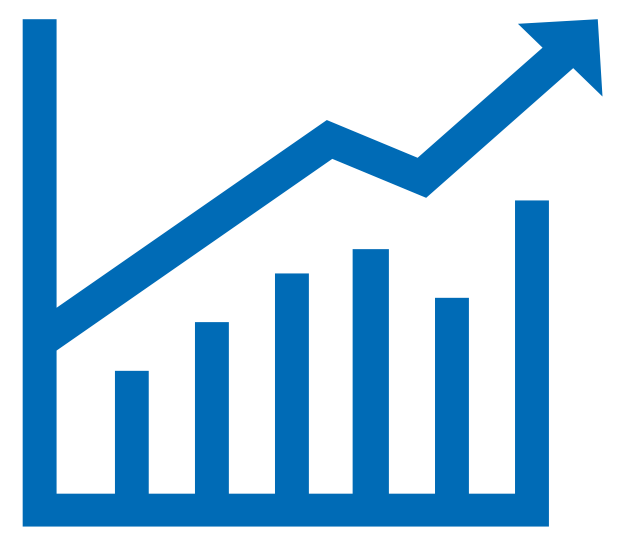
Figure 1: Title