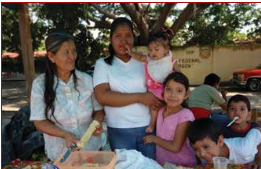
Family selling maize snacks at roadside stall, 2006, Mexico < http://goo.gl/zHSdeh > < http://goo.gl/rek3eJ >.

If related households share the conditional cash transfer among each other, then this