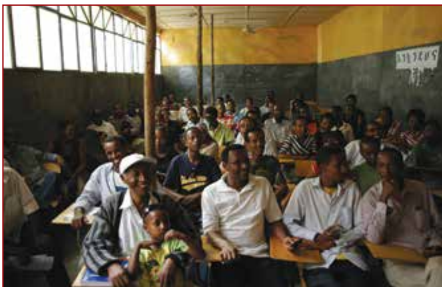
Ethiopia.